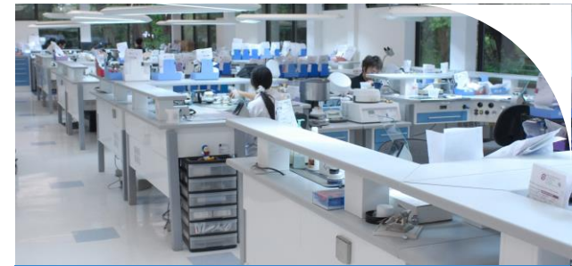
Our clean and modern New Jersey dental laboratory

Just like your dentist, the laboratory is committed to meeting each patient's personal expectations for a quality restoration.